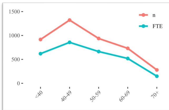
GP number and FTEs by age group

Among those working in clinical general practice, almost 14% report being single handed; and these GPs are least likely to be working part-time. 4